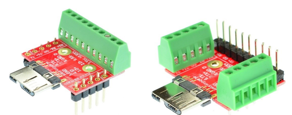
Figure 3: USB3u-BM-BO-V1A Various connections