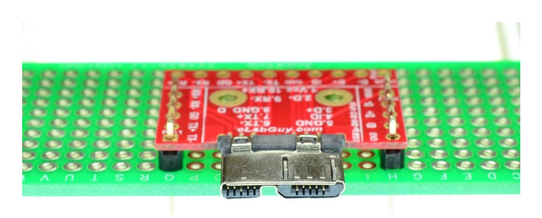
Figure 5: Solid Mounting on prototype PCB